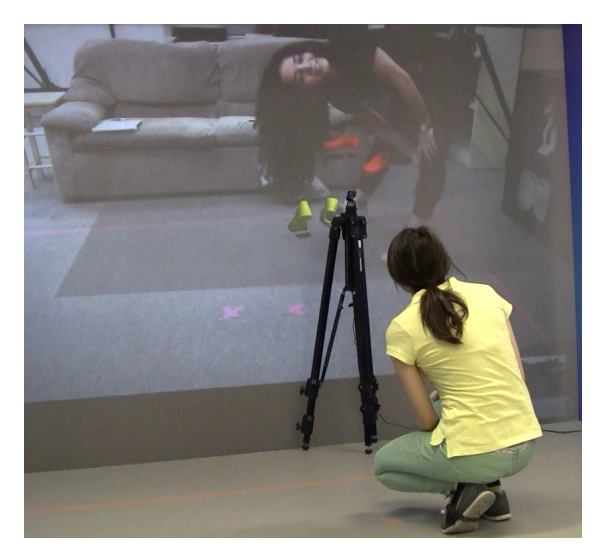
Figure 4. P10 and P11 trying to communicate by squatting so they can see one another's faces as a sign of attention.

For the dance-learning phase, the feet embodiments were useful to follow and learn the steps for most of our participants. Many tutorial videos were captured from multiple cameras, and the changes in view meant that while they were inherently interesting to watch, they were challenging to understand. The feet embodiments provided a consistent view both of the teacher (i.e. the person in the dance video), and the participant.