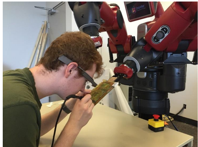
Figure 1. A user controls a robot to help them solder a circuit board, seeing the perspective from the robot’s hand camera in Google Glass.

Each submission will be assigned a DOI string to be included here.