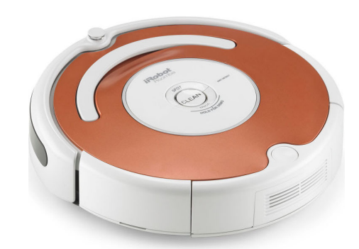
(a) iRobot Roomba