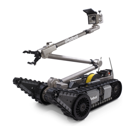
Fig. 7 iRobot Packbot

The Roomba, although successful, is not explicitly designed to follow sociable robotics principles. It has a mechanical appearance and utilizes simple blinking lights for status messages, although the sounds it makes can be construed as happy or sad , and the newest models have a synthetic-speech introduction. Despite its extremely basic interaction design, however, people anthropomorphize and zoomorphize the Roomba anyway, giving it human and social characteristics [22]. In particular, its movements – although mechanical – are described using words such as cute or pathetic . Many people give their Roomba a name and talk to it while it cleans [22]. This suggests that in addition to being functionally useful, the Roomba can become a social part of the home and in a sense, a social participant in the