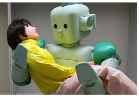
(b) RIKEN RI-MAN