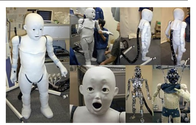
(a) CB^2 baby robot, developed by the JST ERATO Asada Synergistic Intelligence Project [40]