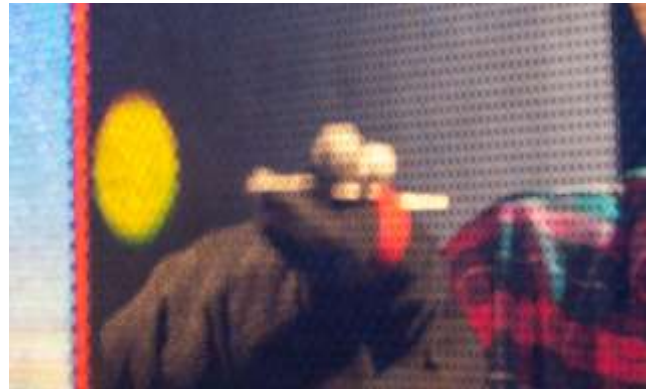
b) Tracking dot's size increases with approaching finger