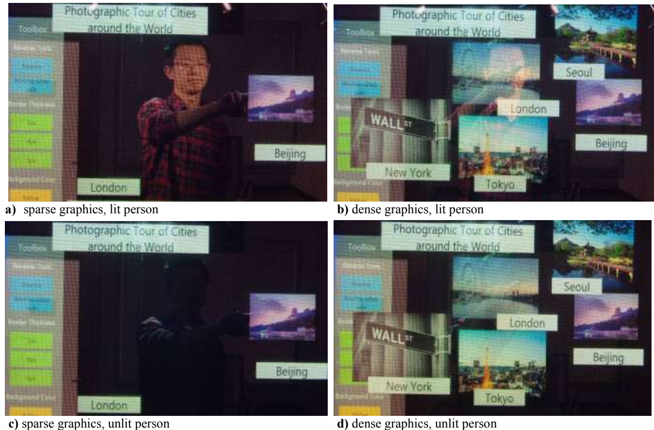
Figure 6. The transparency of FACINGBOARD-2 as affected by various graphic density and lighting conditions.

Our FACINGBOARD-2 setup works well as a prototyping platform, but still has a ways to go before it could be