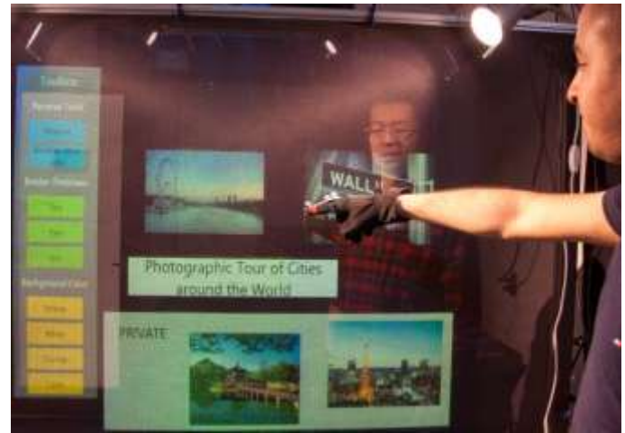
a) Person 1's view: photos / text correctly oriented

Personal work areas. While the public work area is visible to both people (albeit with flipped content), the contents of the private area are distinct to the viewer. For example, Figure 7a shows how Person 1 has 2 photos in his private