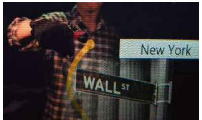
d) Traces enhance gestural paths

Figure 8. Enhancing touch and gestural events. The person is on the other side of the screen.