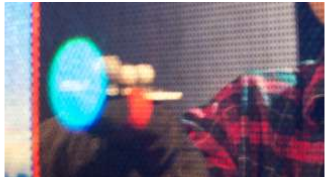
c) Tracking dot at full size, color change indicating touch