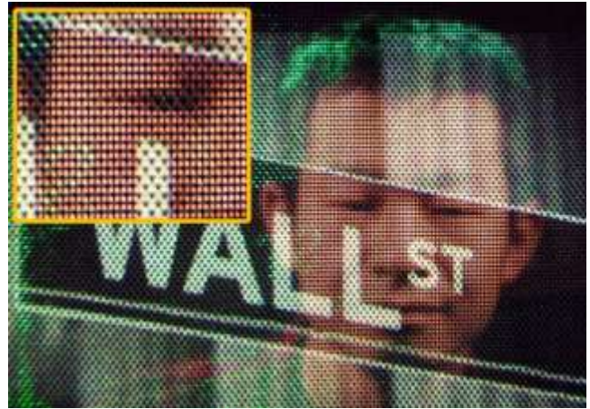
Figure 5. Our open-weave projection screen

projectors are mounted back-to-back above the frame along with mirrors, which affords different graphics per side, and which minimizes occlusion and glare through the screen. Projections are reflected through the mirrors at a downwards angle onto both sides of the fabric. A separate computer controls each projector, and both run our distributed FACINGBOARD-2 software that coordinates what is being displayed. Lighting is also controlled. Room light is kept low to minimize glare, while directional lights illuminate the people on either side.