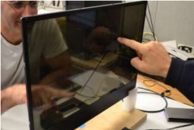
Figure 3. FACINGBOARD-1, our earlier transparent display allowing for two-sided input (here, simultaneous collaborative drawing).

FACINGBOARD-1. Two Leap Motion controllers, one on each side, captured the gestures and touches of peoples' hands relative to the display. Thus people could interact simultaneously through it while at the same time seeing one another. However, both parties saw exactly the same image.