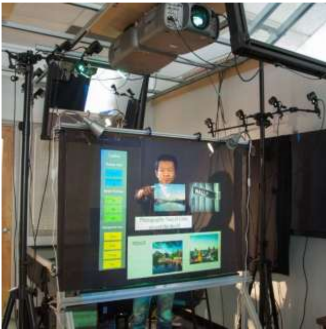
Figure 4. The FACINGBOARD-2 Setup

projectors are mounted back-to-back above the frame along with mirrors, which affords different graphics per side, and which minimizes occlusion and glare through the screen. Projections are reflected through the mirrors at a downwards angle onto both sides of the fabric. A separate computer controls each projector, and both run our distributed FACINGBOARD-2 software that coordinates what is being displayed. Lighting is also controlled. Room light is kept low to minimize glare, while directional lights illuminate the people on either side.