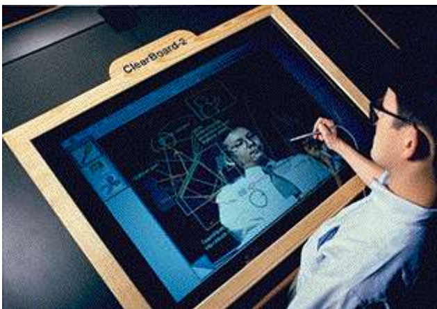
Figure 2. Clearboard, with permission.

Some researchers tried to provide this missing information by building special purpose awareness widgets [e.g., 6], such as multiple cursors as a surrogate for gestural actions. Others sought a different strategy: a simulated ‘see-through’ display for remote interaction. The idea began with Tang and Minneman [18,19], who developed two video-based systems. VideoDraw [18] used two small horizontal displays, where video cameras captured and super-imposed peoples’ hands onto the display as they moved over the screen, as well as any drawing they made with marker pens. VideoWhiteBoard [19] used two wall-sized displays, where video cameras captured the silhouette of a person’s body and projected it as a shadow onto the other display wall.