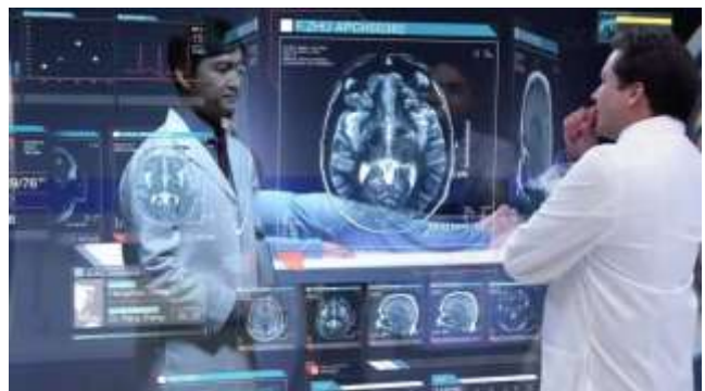
Figure 1. A mocked-up collaborative see-through display. Reproduced from [1]

Our particular interest is in the use of transparent displays in face-to-face collaborative settings, such as in Corning Inc.'s scenario [1] portrayed in Figure 1. Such displays ostensibly provide two benefits 'for free': when a person is working on one side of a transparent screen, people on the other side of it can both see that person and what that