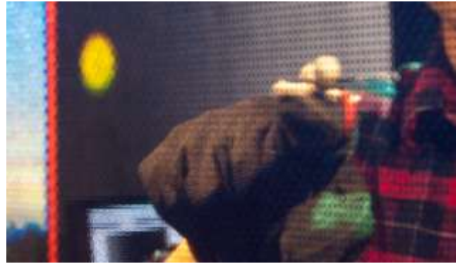
a) Tracking dot small to reflect distant finger

We also use traces [7] to enhance gestural acts. As seen in Figure 8d, an ephemeral trail follows a person's finger