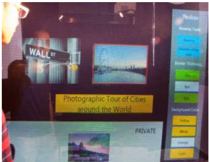
c) His relaxed-WYSIWIS view; text/photos unreversed