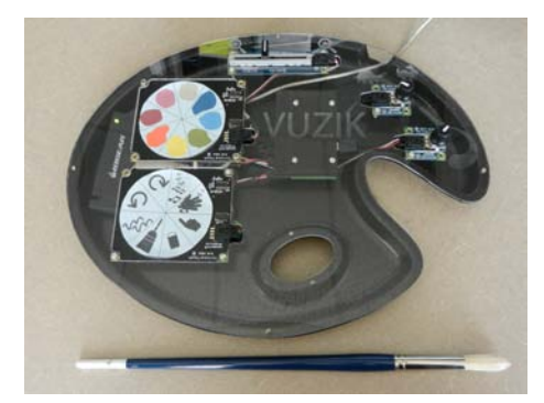
figure 2: Vuzik icon palette and brush.