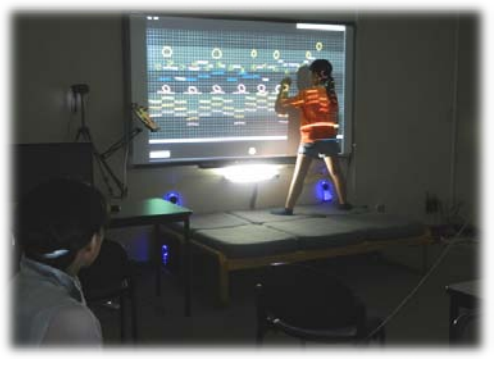
figure 4: Vuzik user evaluation in progress.

We are currently undergoing a user evaluation with 16 or more school children of grades 4-6 for investigating Vuzik 's ability to facilitate music composition for children (See figure 4). The evaluation incorporates a between-subjects comparison of Vuzik and Hyperscore with the goal of understanding the strengths and weaknesses of the former and how it compares or contrasts to similarly motivated interfaces. Over two sessions, subjects will learn the interface, explore example compositions, complete a composition which has beginning and ending provided, receive brief training in composition on the interface, complete a composition by adding melody to a provided accompaniment, and finally compose their own music.